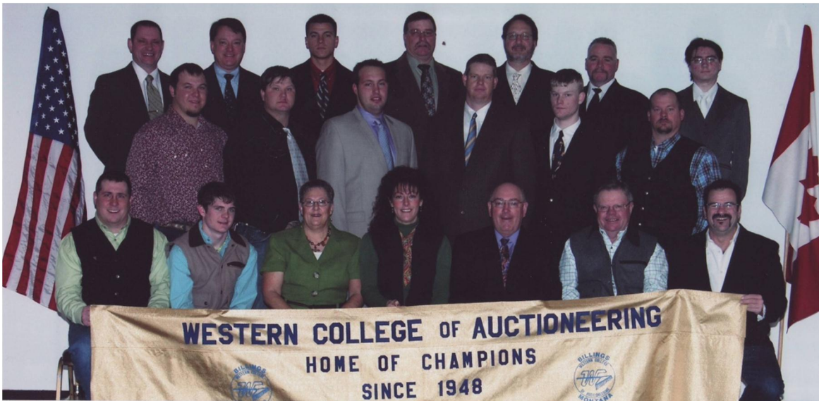
Class 220 Western College of Auctioneering Billings, Montana March 8-18, 2010