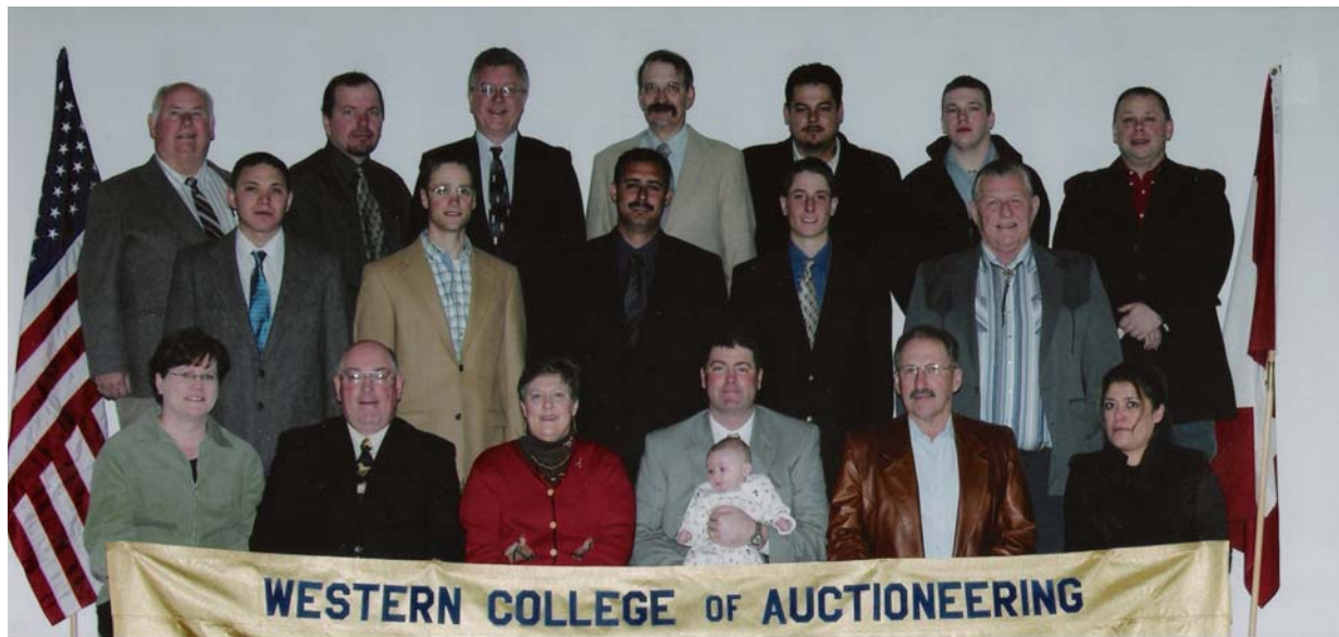
Class 208 Western College of Auctioneering Billings, Montana March 6-16, 2006